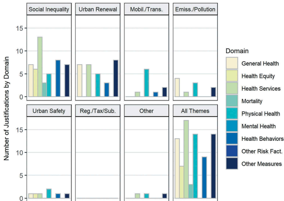
Figure 2. Distribution of health justifications by domain across policy themes.

poverty policies. Specific references to this domain included discussions of policy impacts on maternal and infant mortality (Glejberman 2005), infant mortality (Cortés Castellanos 2005), and neonatal, post-natal and under-five mortality (Maldonado 2005).